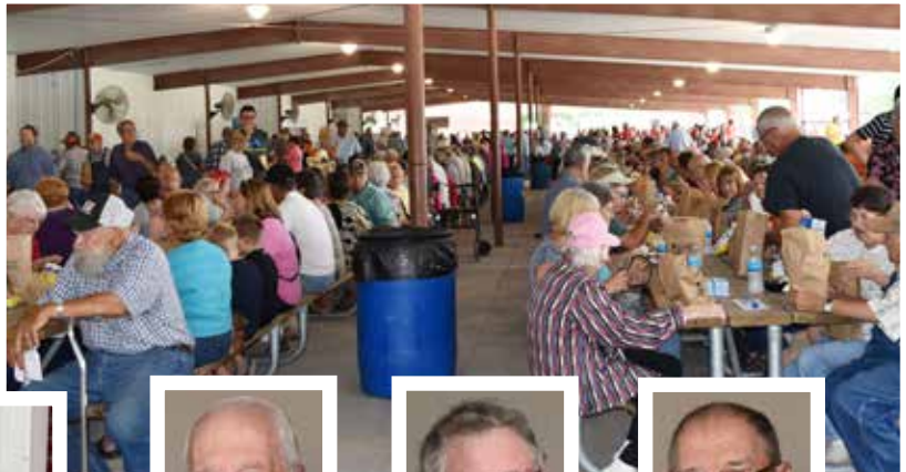
▼ Thousands of Access Energy Cooperative members turned out for the annual meeting.