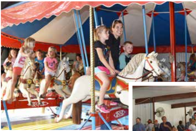
▲ Tractor and carousel rides were favorite activities for kids of all ages.