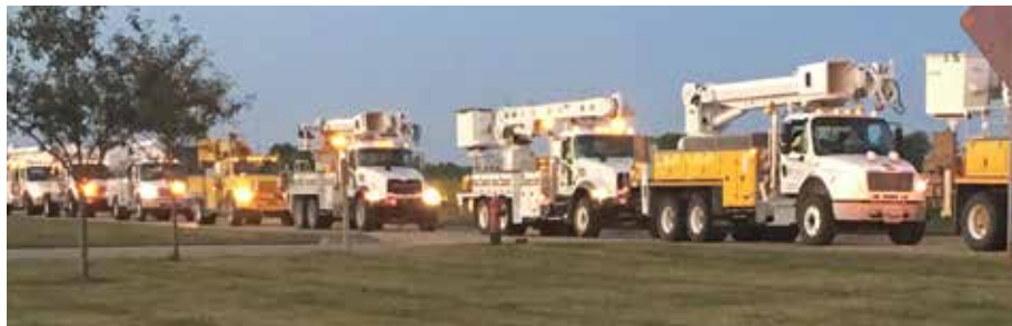
At 6:30 a.m. on Monday, Sept. 11, Iowa's crews departed in a convoy for Okefenokee Rural Electric Membership Corporation headquarters in Nahunta, Georgia. Once there, the linemen received their orders for restoring power to the area's electric cooperative members affected by Hurricane Irma.