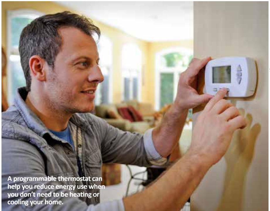
A programmable thermostat can help you reduce energy use when you don't need to be heating or cooling your home.

With the information gathered, it's important to develop a plan. If your priority is cutting energy costs, you can select the measure that will